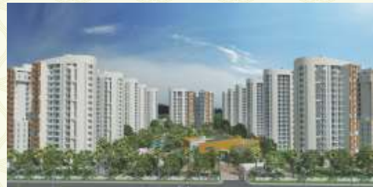
Parikrama, Sector-20, Panchkula