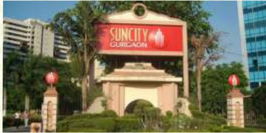
Suncity Township, Golf Course Road, Gurgaon