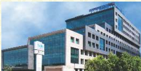
Time Tower, M.G. Road, Gurgaon