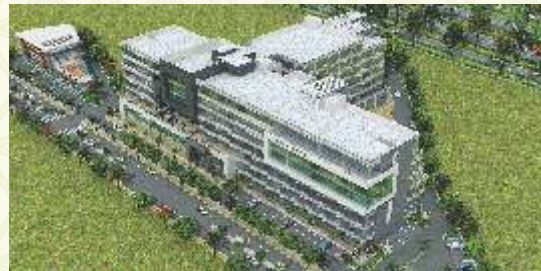
Success Tower, Sector-65, Gurgaon

Suncity Projects is one of the most eminent real estate companies in North India. The Group has built an unshakable reputation for quality, efficiency, trust and meticulous planning. Suncity Projects in North India are famous for offering top quality amenities, superlative designs, timely completion, guaranteed possessions and handing over of projects ranging from Townships to Group Housing to Luxury Apartments. In Corporate & Retail space Suncity Projects offers Shopping Malls to Office Complexes. The organisation is backed with the unmatched experience and expertise of two of India's most reputed business conglomerates - The Essel Group and the Action Group.