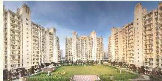
Essel Tower, M.G. Road, Gurgaon