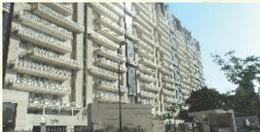
La Lagune, Golf Course Road, Gurgaon